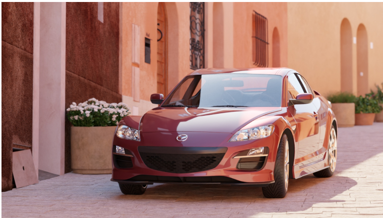
Figure 3.2 – Example output image denoised using color and auxiliary feature images (albedo and normal).