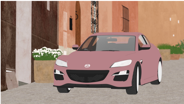
Figure 3.4 – Example albedo image obtained using the first diffuse or glossy (non-delta) hit. Note that the albedos of perfect specular (delta) transparent surfaces are computed as the Fresnel blend of the reflected and transmitted albedos.

For metallic surfaces the albedo should be either the reflectivity at normal incidence (e.g. from the artist friendly metallic Fresnel model) or the average reflectivity; or if these are constant (not textured) or unknown, the albedo can be simply 1 as well.