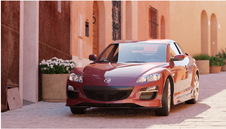
Figure 3.1 – Example noisy color image rendered using unidirectional path tracing (64 spp). Scene by Evermotion.

The filter can be created by passing "RT" to the oidnNewFilter function as the filter type. The filter supports the parameters listed in the table below. All specified images must have the same dimensions. The output image can be one of the input images (i.e. in-place denoising is supported).