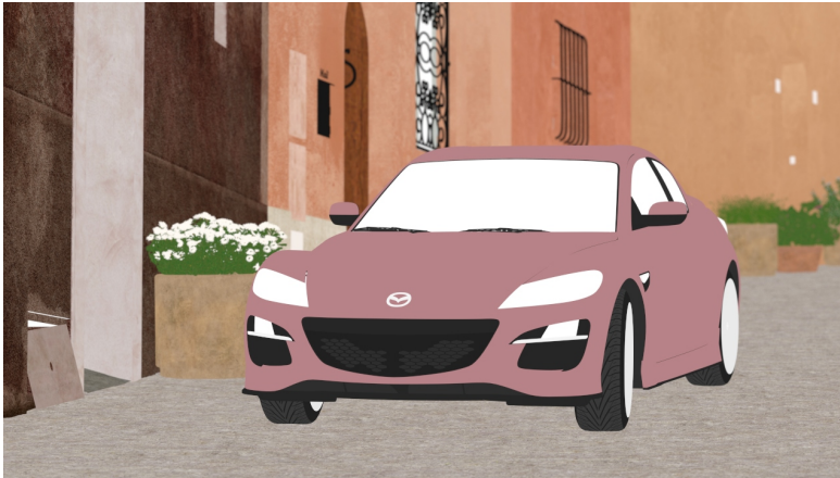
Figure 3.3 – Example albedo image obtained using the first hit. Note that the albedos of all transparent surfaces are 1.

For simple matte surfaces this means using the diffuse color/texture as the albedo. For other, more complex surfaces it is not always obvious what is the best way to compute the albedo, but the denoising filter is flexible to a certain extent and works well with differently computed albedos. Thus it is not necessary to compute the strict, exact albedo values but must be always between 0 and 1.